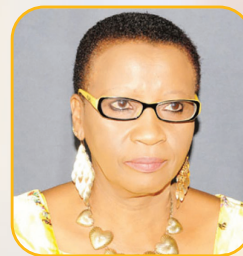
Hon. Hanifa Kwoyaya State Minister for Health (General Duties)