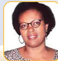
Hon. Margaret Muhanga State Minister for Health (Primary Health Care)