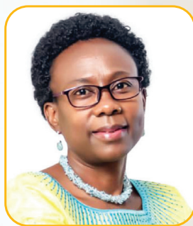
Hon. Dr. Jane Ruth Aceng Ocero Minister of Health